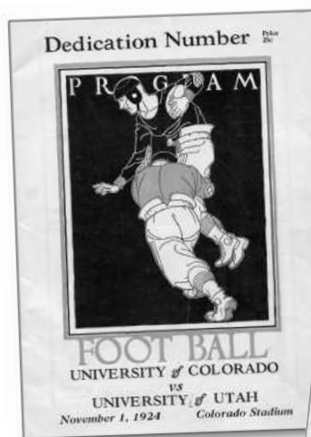
Official game program from 1924 homecoming versus Utah.

Rushing: 2-minus 12; Passing: 28-19-0, 248, 3 TD.